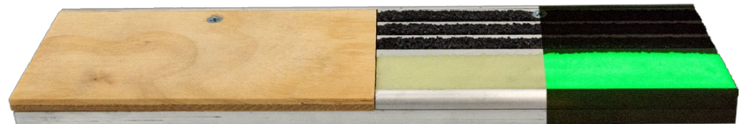
Base & Wood (for use during construction)