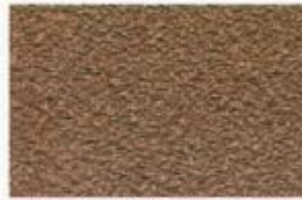
Teak Brown (marine color)