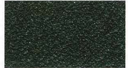
Flat Black Medium 46 Grit