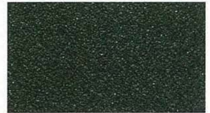
Super Fine Black (marine color) 70 Grit