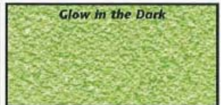
Glow in the Dark