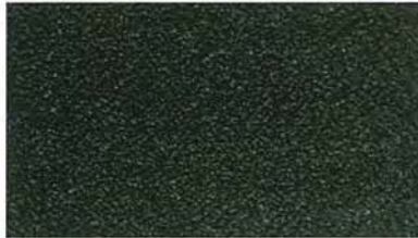
Flat Black Fine 54 Grit