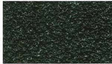
Negative One Skateboard Black

For custom rolls and die cuts, please contact factory.