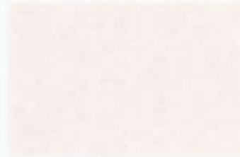
Clear Fine (marine color)