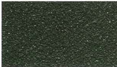
Ultra Grip Black 60 Grit