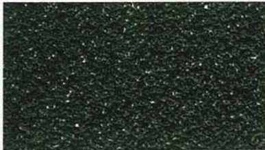
Sparkle Black 46 Grit