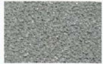
Ocean Gray (marine color)