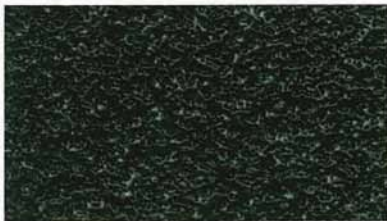
Flat Black Coarse 36 Grit