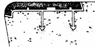
Detail - sure hold anchor in concrete step